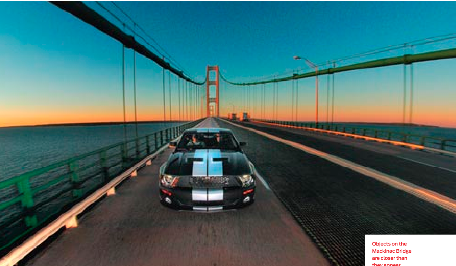
Objects on the Mackinac Bridge are closer than they appear.